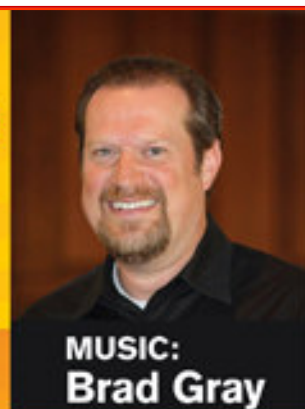
MUSIC: Brad Gray